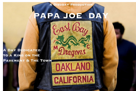
RUN TIME: 8:36