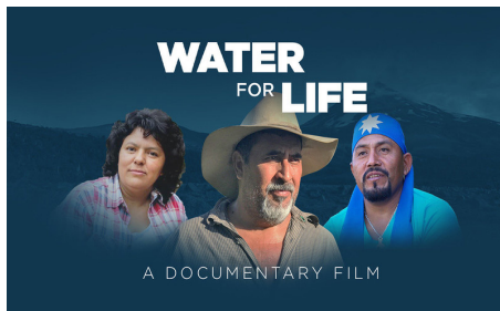
WATER FOR LIFE

Water For Life explores the collision of water rights, Indigenous beliefs, and resource extraction through the lives of three community leaders in Central and South America. Our protagonists face harassment and death threats as they fight the powerful forces that threaten the environmental, cultural and economic survival of their communities.