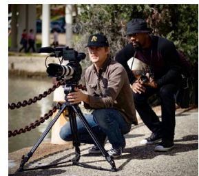
Directors of “Wake The Town”

Three former residents of Oakland CA tell their stories of leaving the city they called home. Two of the three have now died--one of murder--showing the high tragically cost of housing instability.