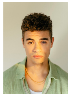
Director of “Huli”

Sol, a Black biracial young man, ran away from New York to Hawaii to start a new life. During a period of heightened radicalized violence on the US continent, he seeks a new “home.” He’s a hyper-driven escapist - training as a boxer, living out of his car, and seeking the “American dream” of opulent wealth. While well intended, Sol lacks balance, restraint, and roots.