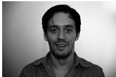
Director of “Grady Tate’s Windmills”

Grady Tate, legendary, masterful, jazz drummer and vocalist. For more than six decades, Grady’s distinctive sound has graced literally thousands of recordings and performances with such musical giants as Quincy Jones, Miles Davis, Duke Ellington, Ray Charles, Tony Bennett, Ella Fitzgerald, Aretha Franklin and Lena Horne.