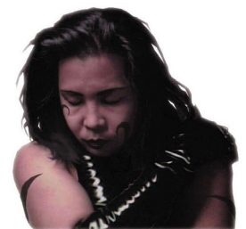
Director of ECLIPSE’ DESCIPLE

A paranormal bounty hunter goes after a renegade demon while trying to find the answers to his father’s demise. This short is a prequel to 48 hour film project that screened in 2022 called, The Eclipse.