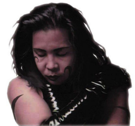
Director of ECLIPSE’ DESCIPLE

A paranormal bounty hunter goes after a renegade demon while trying to find the answers to his father’s demise. This short is a prequel to 48 hour film project that screened in 2022 called, The Eclipse.